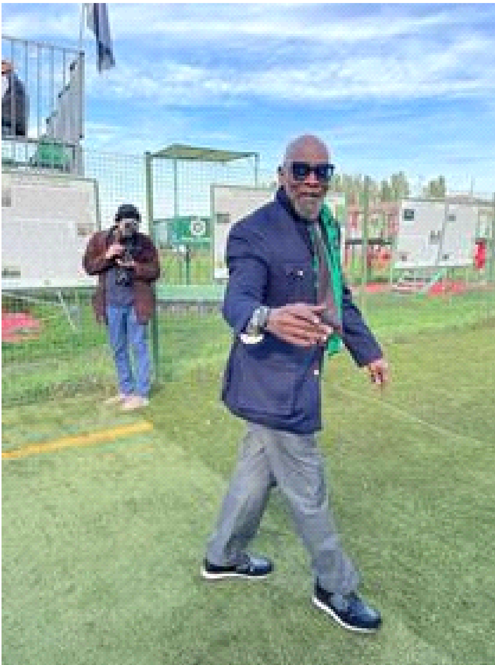
Chris Gardner on the Brera pitch in Milan

NEW YORK, DUBLIN and MILAN, May 15, 2023 (GLOBE NEWSWIRE) -- Brera Holdings PLC ("Brera Holdings" or the "Company", Nasdaq: BREA) announced that Board Member Chris Gardner has arrived in Italy to attend several meetings and major events this week. Entrepreneur and author of the New York Times bestseller The Pursuit of HappYness , his autobiography that inspired the movie starring Will Smith and directed by Gabriele Muccino, Chris Gardner is deeply engaged in the activity of, "The Christopher P. Gardner Foundation," which works to change the lives of young people.